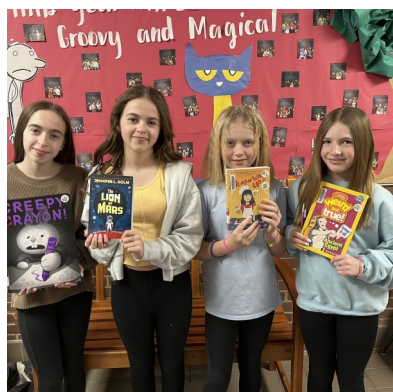
Battle of the Books Winners in Gr. 5!